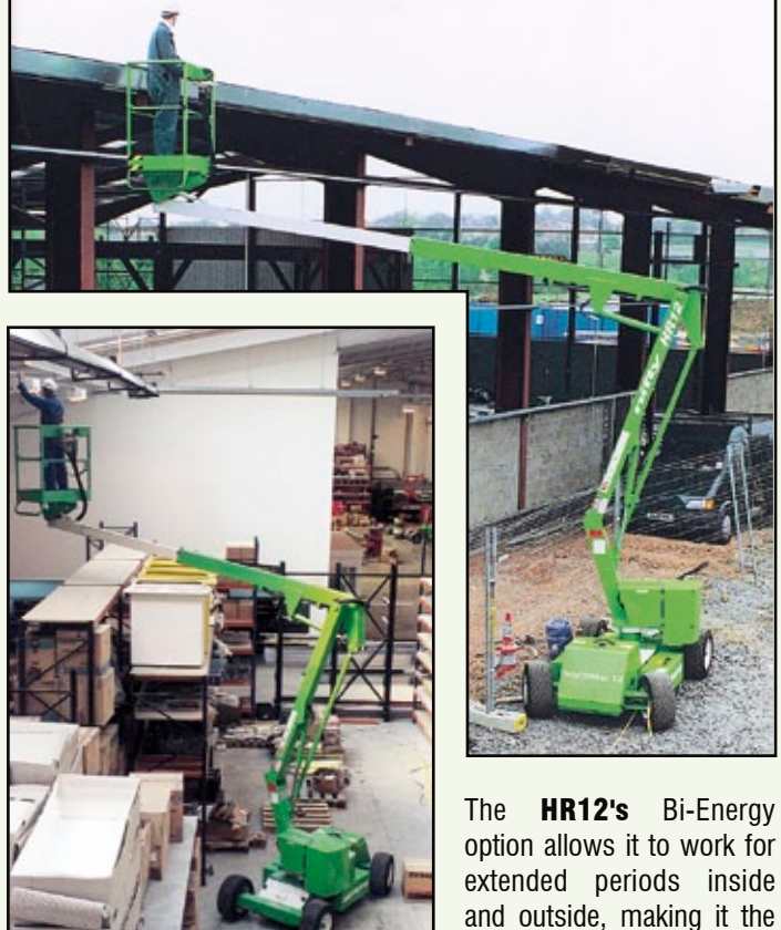
and outside, making it the perfect all-rounder.

Due to a policy of continuing development and improvement, Niftylift reserves the right to change any specification without notice. Please confirm exact specification before ordering